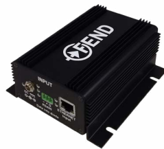
Fend Data Diode